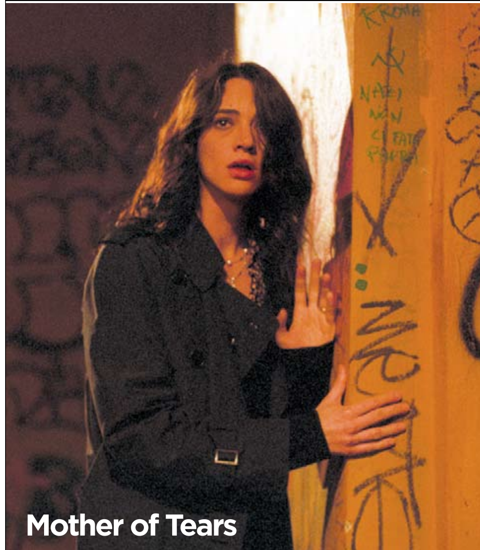
Mother of Tears