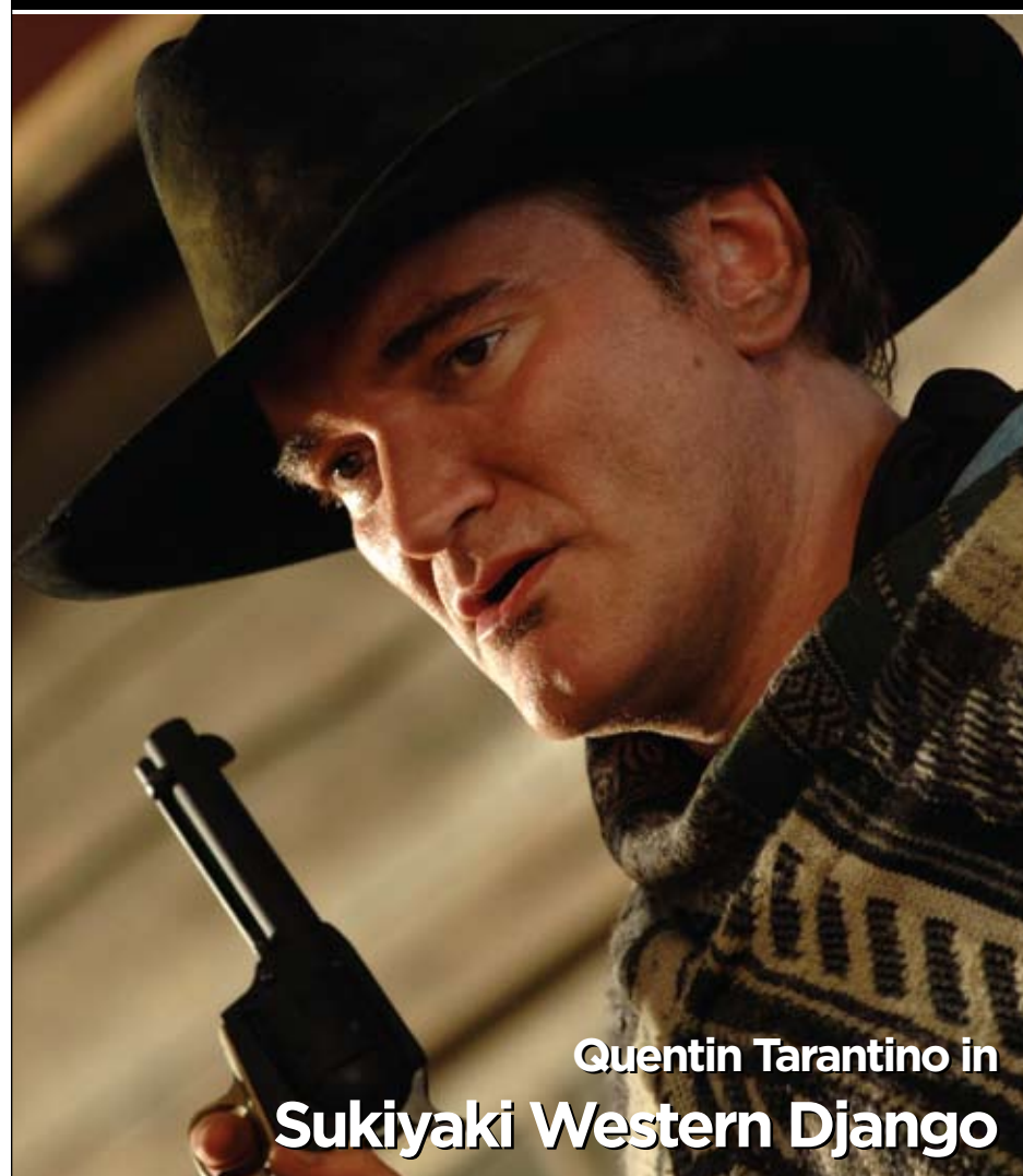
Quentin Tarantino in Sukiyaki Western Django